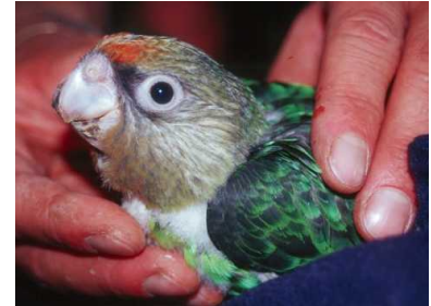
Chick with damaged beak