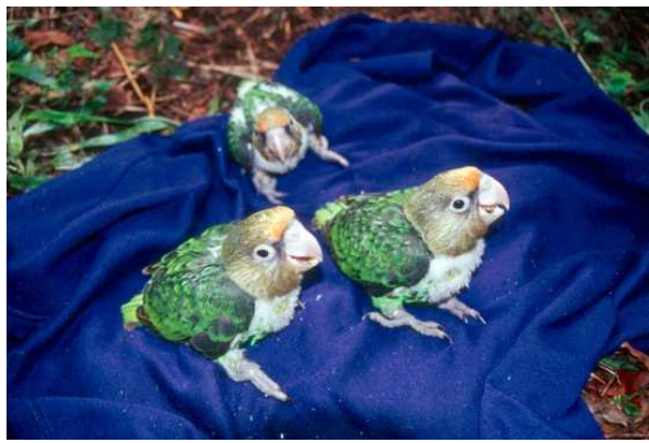
Chicks removed from nest to collect vital statistics

three, was found to have suffered serious injuries to her beak and also showed significant weight loss. The concern was that the severity of the damage might cause feeding problems later given the importance of the beak in obtaining its natural diet. After obtaining a wide range of expert local and international advice it was considered that the damage to the beak made its survival in the wild highly unlikely. It was agreed that the chick should be taken into captivity and incorporated into the captive breeding programme. The other two chicks fledged successfully into the wild. The female chick settled into captivity well, after two months its beak had healed although it was skew and lacked its tip.